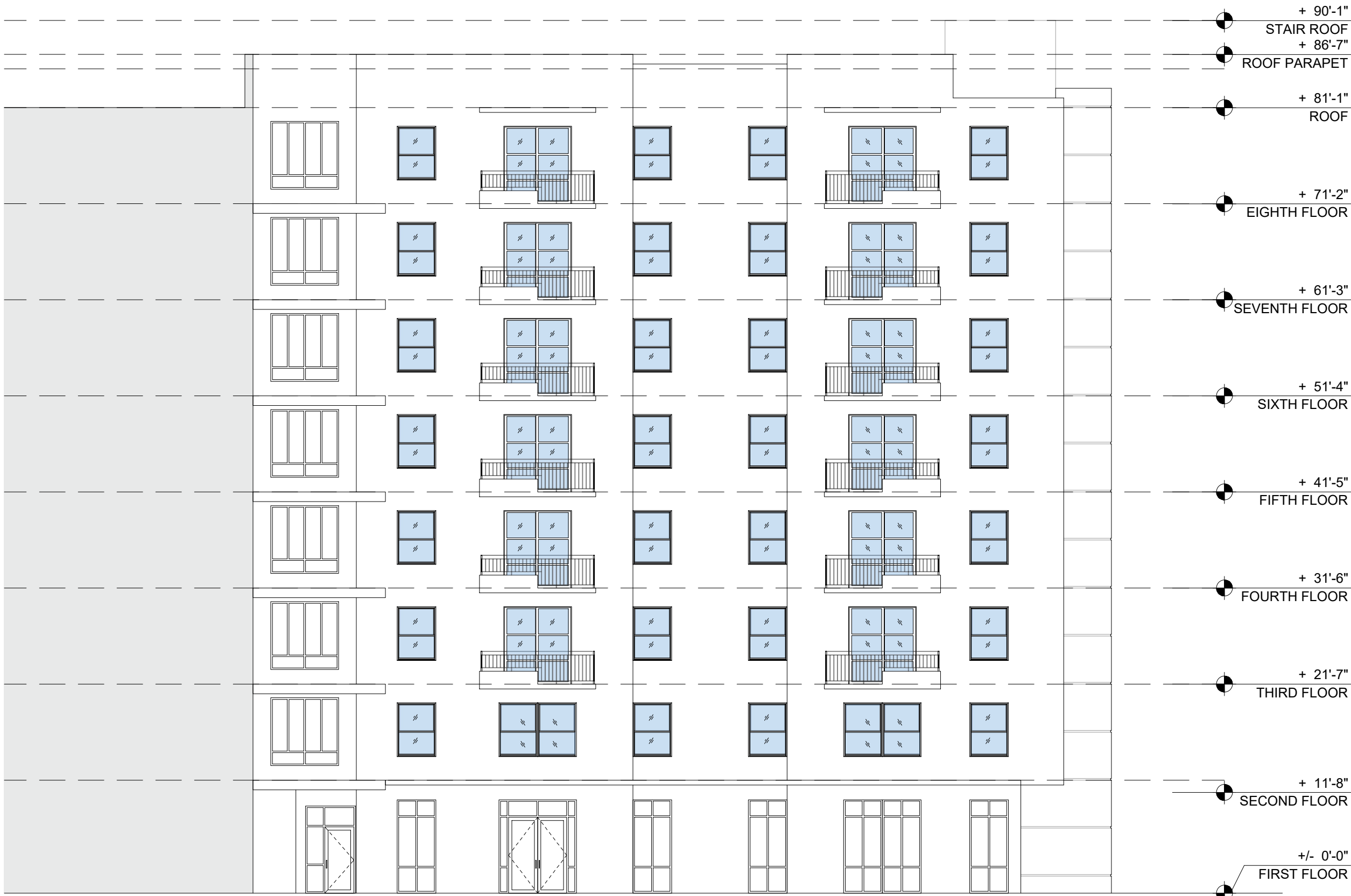
C4 BUILDING ELEVATION 3/32" = 1'-0"