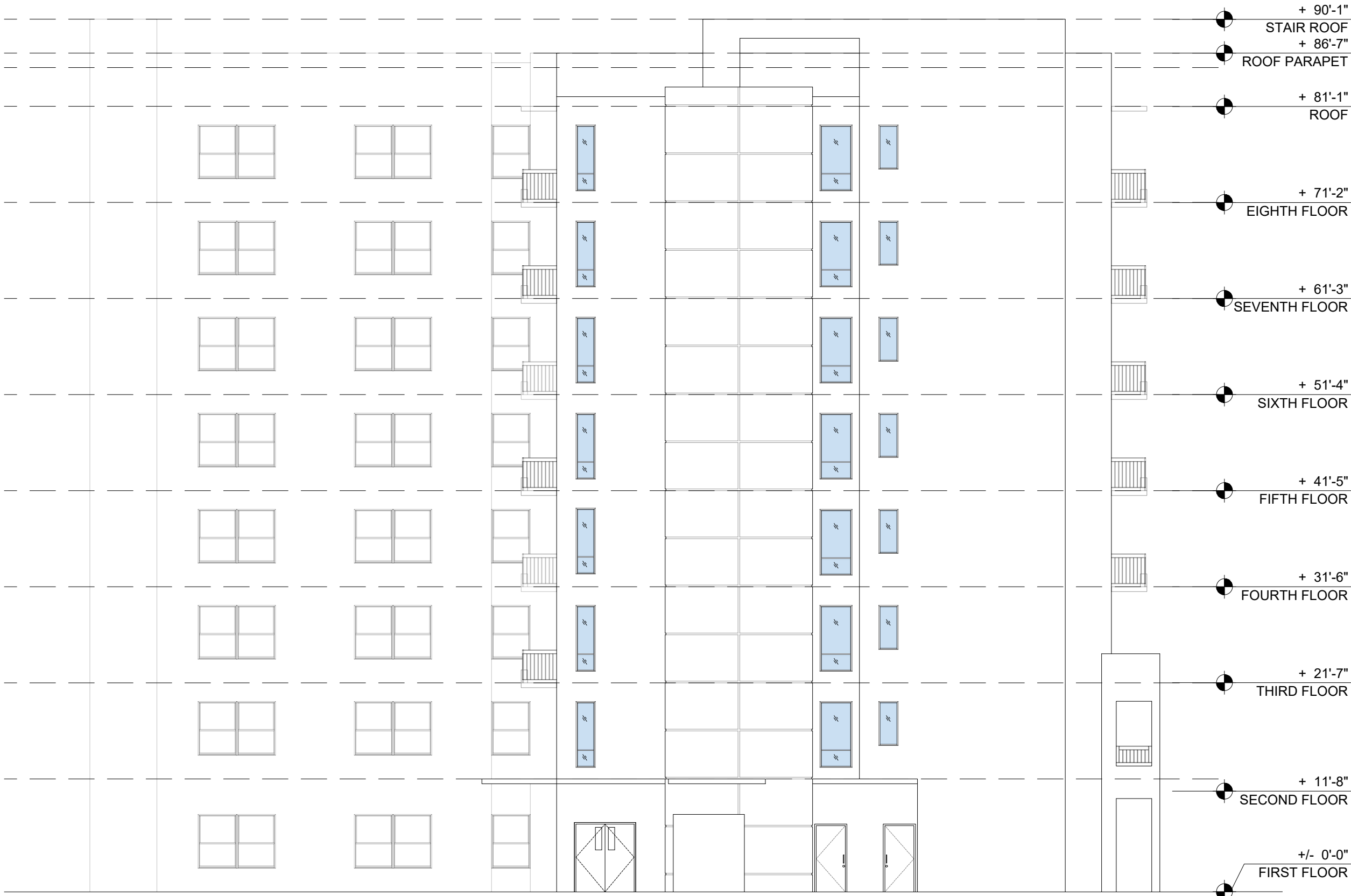
A4 BUILDING ELEVATION 3/32" = 1'-0"