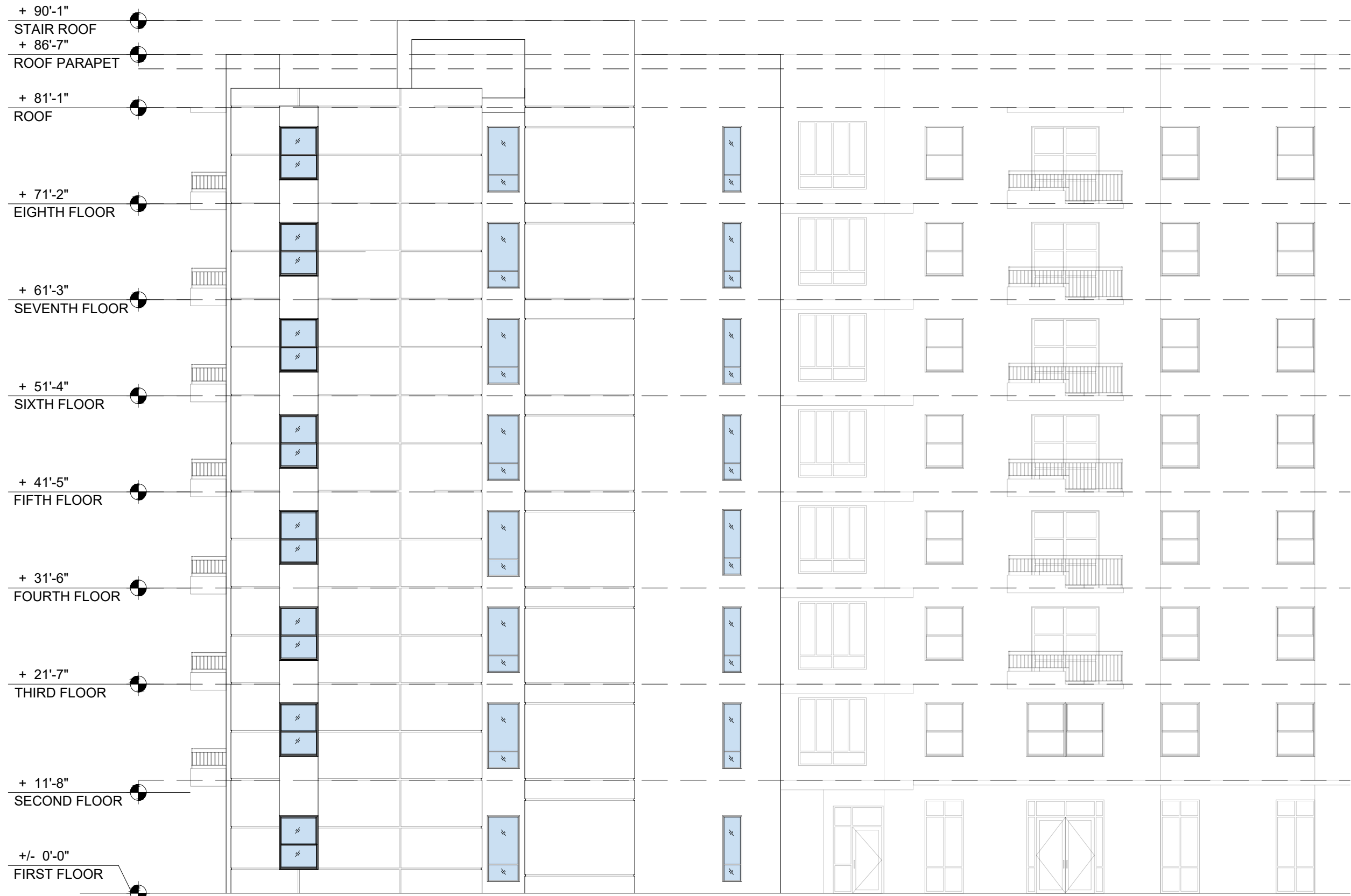
C1 BUILDING ELEVATION 3/32" = 1'-0"

A VIOLATION OF THE LAW FOR ANY PERSON, UNLESS ACTING UNDER THE DIRECTION OF A LICENSED ARCHITECT TO ALTER THESE PLANS AND SPECIFICATIONS. THIS DOCUMENT CONTAINS PROPERTY INFORMATION AND SHALL NOT BE USED OR REPRODUCED OR ITS CONTENTS DISCLOSED, IN WHOLE OR IN PART, WITHOUT THE PRIOR WRITTEN CONSENT OF GALLO HERBERT ARCHITECTS. A VIOLATION OF THE LAW FOR ANY PERSON, UNLESS ACTING UNDER THE DIRECTION OF A LICENSED ARCHITECT TO ALTER THESE PLANS AND SPECIFICATIONS. THIS DOCUMENT CONTAINS PROPERTY INFORMATION AND SHALL NOT BE USED OR REPRODUCED OR ITS CONTENTS DISCLOSED, IN WHOLE OR IN PART, WITHOUT THE PRIOR WRITTEN CONSENT OF GALLO HERBERT ARCHITECTS.